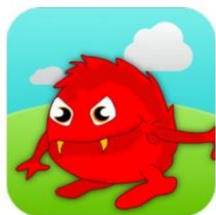
Monster Phonics Learn to Spell the First 100 High-Frequency Words

There is an App available appropriate for Year 1/ 2 and onwards that can support the reading and spelling of High Frequency Words but there is no expectation to purchase this.