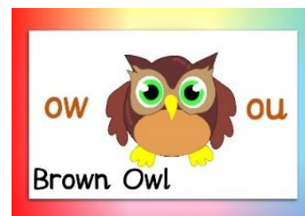
Long ow sound