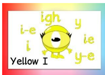
Long I sound