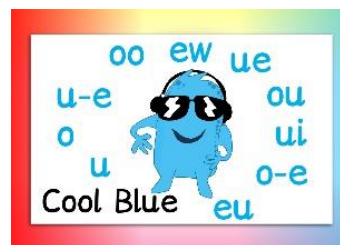
Long oo sound