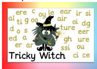
Tricky Letters that make a different sound