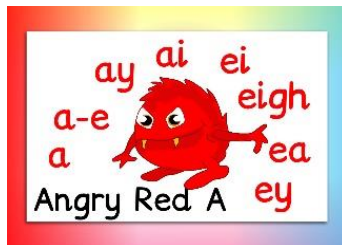
Long A sound