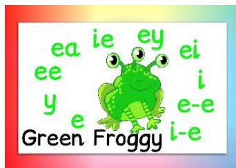
Long E sound