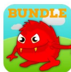
Monster Phonics Learn to Spell the Next 200 High-Frequency Words £2.99