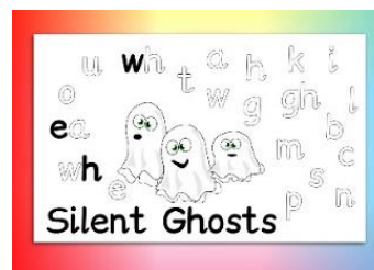
Silent Letters that have no sound