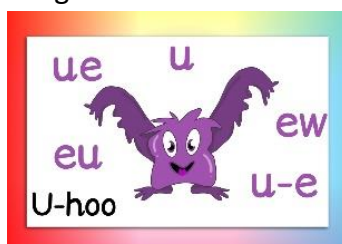
Long U sound