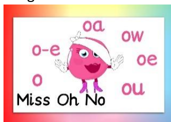
Long O sound