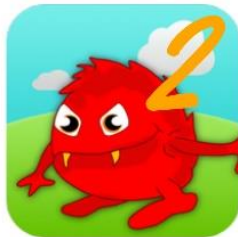
Monster Phonics Learn to Spell the Next 200 High-Frequency Words